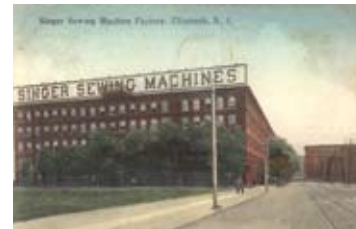
Singer Sewing Machine Factory in Elizabeth Post mark 1909